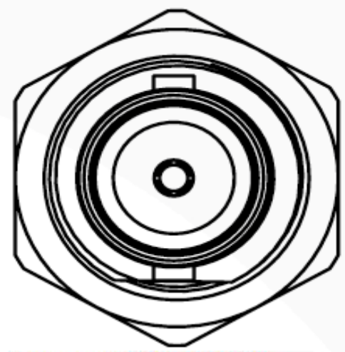
Recommended Mounting Hole